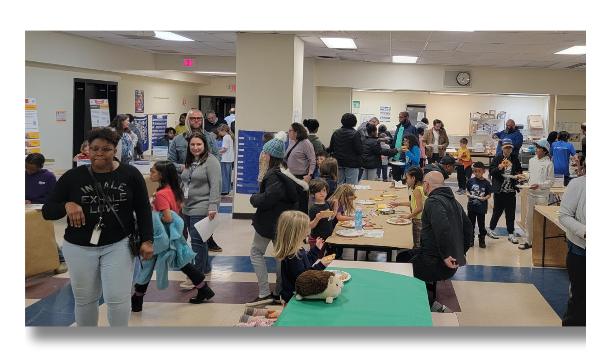
Hatch Elementary School March 6, 2024