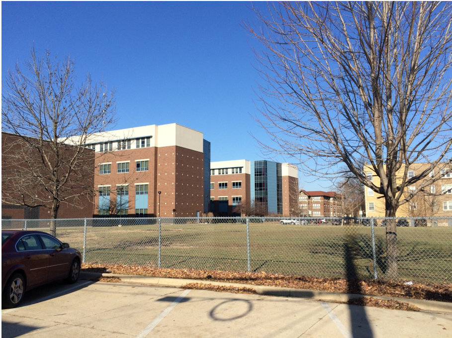
View of Percy Julian North of Site