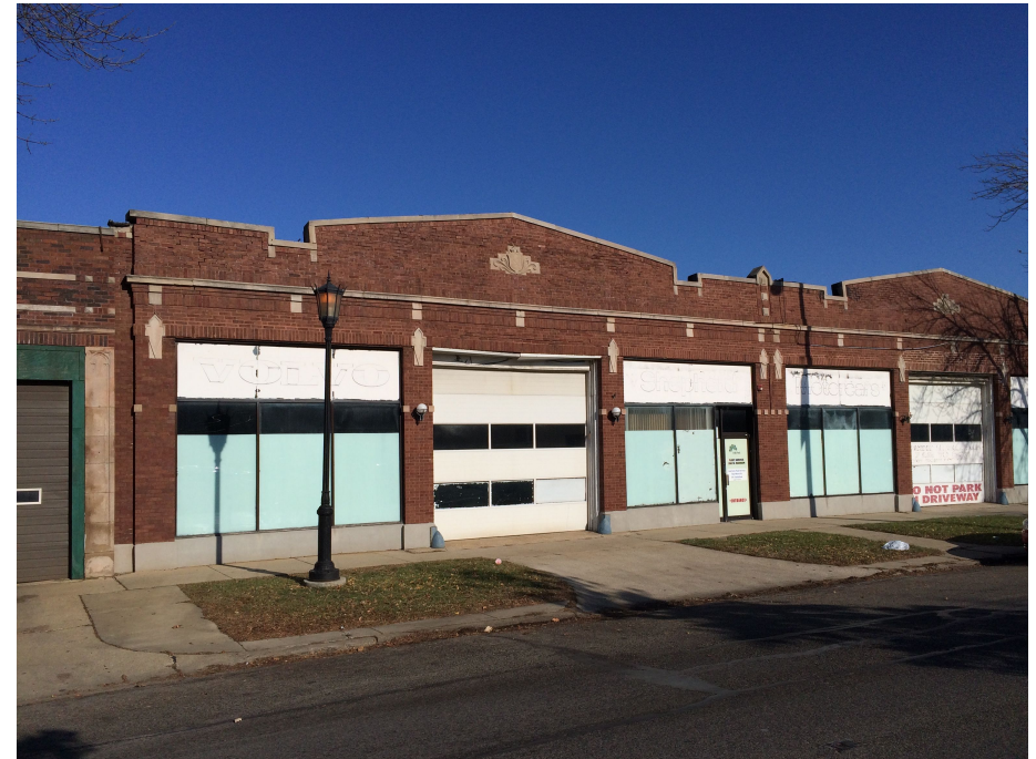
Previous Volvo Dealership facing Madison Street