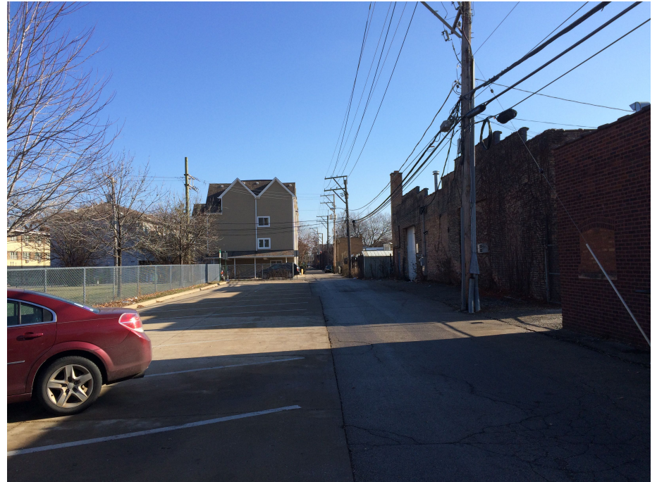
Alley and Existing Parking Behind Site